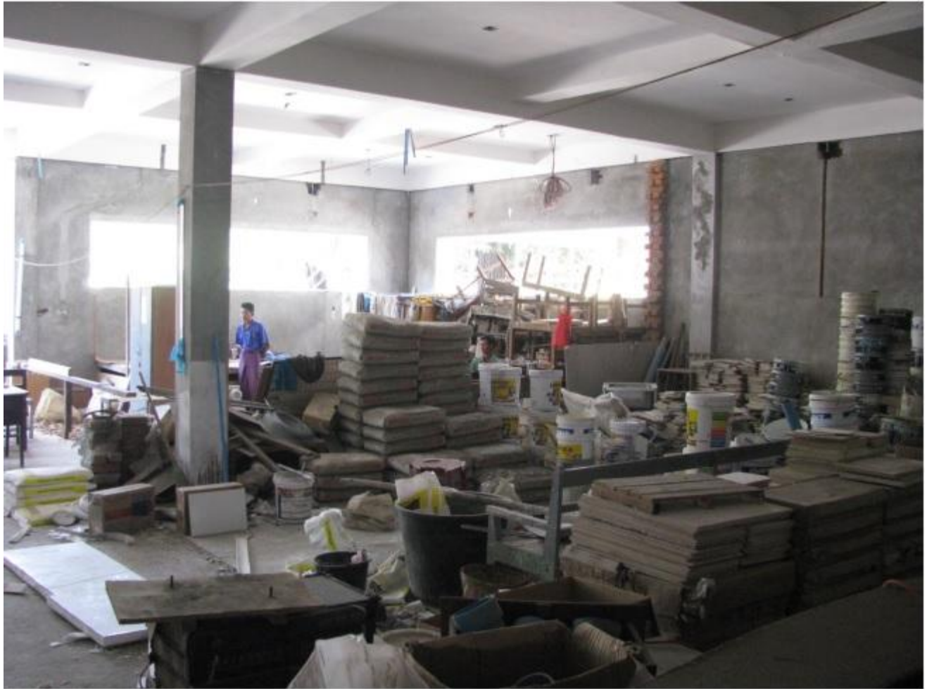
Actual Site Photograph of the Area Earmarked for MRI Machine