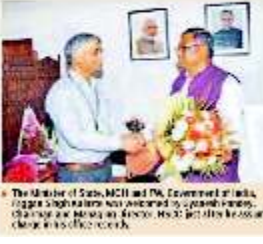
The Minister of State, MCI and P.A. Government of India...