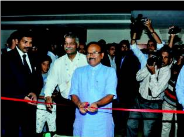
Visit of Hon'ble Chief Minister of Goa, Shri Laxmikant Parsekar at HSCC's Stall at the Summit

HSCC participated in an exhibition during the "Knowledge Exchange Summit-2016, Goa" held on 11th June 2016. Shri Gyanesh Pandey, CMD, HSCC, made a special presentation about e-Healthcare and ICT which enlightened the dignitaries about the importance of digitization & Information Technology in Health Care Sector. Hon'ble Chief Minister of Goa, Shri Laxmikant Parsekar inaugurated HSCC's Stall he was briefed by Shri Gyanesh Pandey, CMD, HSCC, about various projects undertaken by HSCC in the state of Goa.