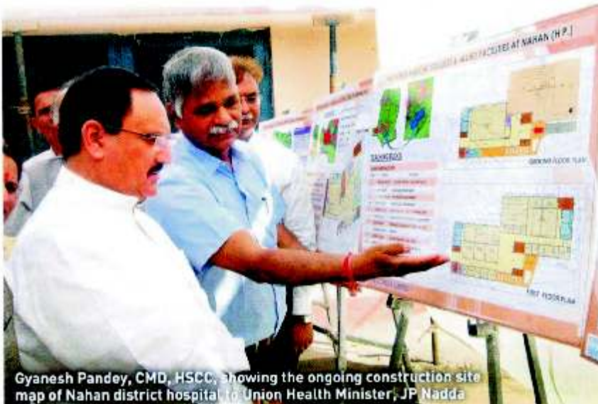
Gyanesh Pandey, CMD, HSCC, showing the ongoing construction site map of Nahan district hospital to Union Health Minister, JP Nadda