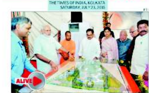
PM Narendra Modi reviews a model of AIIMS Gorakhpur during the foundation stone laying ceremony in Gorakhpur on Friday