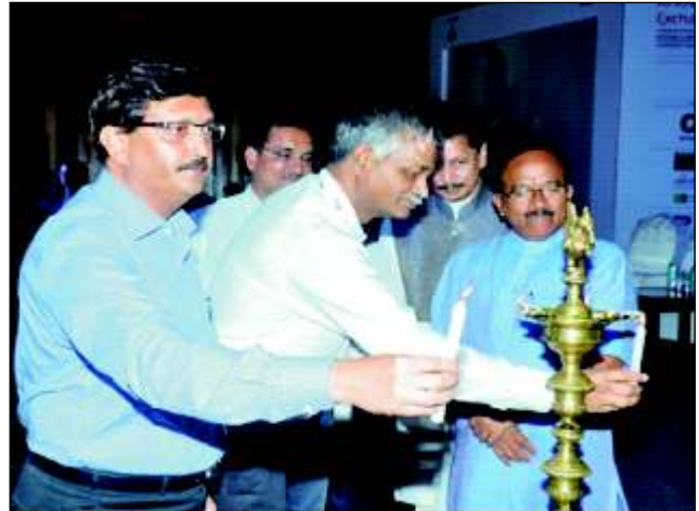
Inauguration of Knowledge Exchange Summit by Hon'ble Chief Minister of Goa, Shri Laxmikant Parsekar & Shri Gyanesh Pandey CMD, HSCC