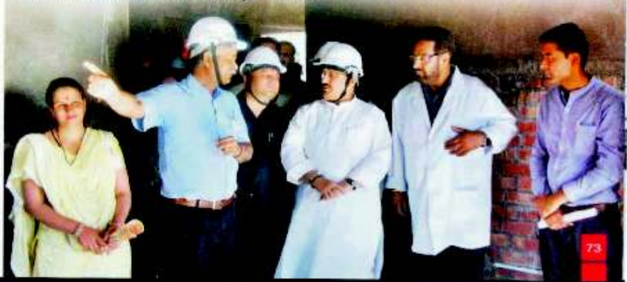
HSCC officials with Health Minister, JP Nadda

In India and neighbouring countries such as Myanmar, Sri Lanka, Nepal and Bhutan. In the last three decades, HSCC has developed in-house capacities and capabilities in planning, architecture, design and engineering, Information Technology, etc. in creating Health Sector Infrastructure. ■