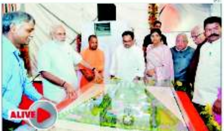
PM Narendra Modi reviews a model of AIIMS Gorakhpur during the foundation stone laying ceremony in Gorakhpur on Friday