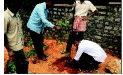
NIMHANS - Bangalore