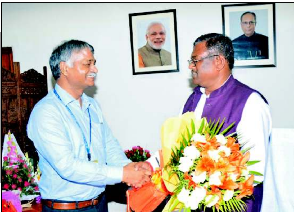
Hon'ble Minister of State, MOH&FW, Govt. of India, Shri Faggan Singh Kulaste assumed charge of the office on 6th July 2016, Shri Gyanesh Pandey, CMD, HSCC is seen felicitating him in his office.