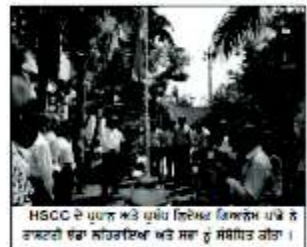
HSCC से प्राप्त की गई प्रथम श्रेणी का निवेशन पत्रों के आकस्मिक वित्तियन के बारे में जानकारी के लिए