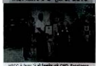
HSCC से प्राप्त की गई प्रथम श्रेणी का निवेशन पत्रों के आकस्मिक वित्तियन के बारे में जानकारी के लिए