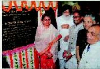
Chief Minister Farooq Singh Bahadur, accompanied by Union Minister Bhaskaran Kumar Baidal and Minister Anil Kulkarni, inaugurating the advanced cancer centre in Bangalore on Thursday.

Union Minister for Food Processing Bhaskaran Kumar Baidal said besides opening advanced cancer treatment centres at Government Medical Colleges in Arnieur, Pattabi and Perudra, the state government had taken another initiative of providing free treatment to