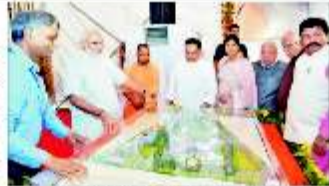
CURRIES IN WORK: Prime Minister Narendra Modi is seen laying the foundation stone of AIIMS Gorakhpur on Friday.