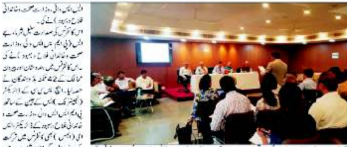
ایچ ایس سی کی کانفرنس میں 29 جولائی 2016 کو...