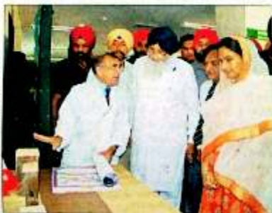
बरिंडा में एडवोकेट कैमर इंस्टीट्यूट का उद्घाटन करने के दौरान कैमर के बारे में मुख्यमंत्री प्रकाश सिंह बादल और केंद्रीय मंत्री अश्विनी कुमार शर्मा के साथ बातचीत करते हुए।