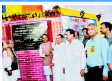
Ministry Health Care Minister during Singh Kalra, Health & Family Welfare Minister JP Kalra, Minister & State Minister Narendra Singh Kalra and HSCC CMD Gyanesh Pandey awarded the foundation stone being ceremony of a super specialty block at Bapu Bapu Medical College, Raigarh.