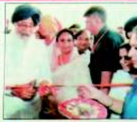
कैमर अस्पताल का उद्घाटन करते हुए प्रकाश सिंह बादल।

भरिंडा, 7 जुलाई (कलविद) : आज यहां पंजाब में चलती कर्मी मुख्यमंत्री प्रकाश सिंह बादल ने कहा कि आम आदमी पार्टी ने पूरा मैनीफेस्टो को तुलना पत्र में छोड़ने से कर देश विरोधी की तरह पहुंचाई है। 'आप' के इस ऐलान से हमको लीडरशिप की संकरी मानसिकता सामने आई है। बादल ने कहा कि 'आप' नेताओं द्वारा इस मुद्दे पर की जा रही माफी की पेशकश अब फिजूल है, क्योंकि माफी से इनके द्वारा किए मुकाम की भरपाई नहीं हो सकती।