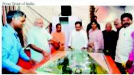
Prime Minister Narendra Modi (left) laying the foundation stone for AIIMS Gorakhpur during his visit to Gorakhpur along with Union Health Minister JP Nadia (right) and other officials.

With up on CP situations, Centre provides better health facilities in Uttar Pradesh.