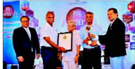
HSCC bags governance award

THE TIMES OF INDIA, NEW DELHI TUESDAY, JULY 26, 2016