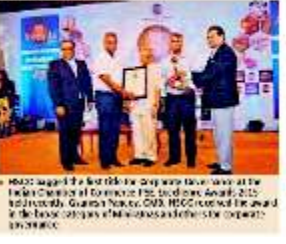
HSCC bagged 3rd Best CSR for the 3rd year...