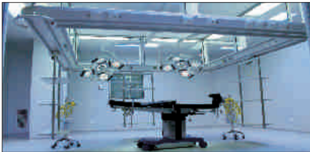
Modular OT, SIC, New Delhi