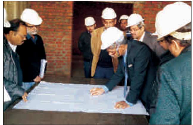
Surgical Block, AIIMS, New Delhi on 23rd January, 2015