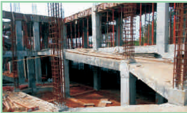
50 Beded Mother and Child Hospital, Irinjalakuda, Kerala