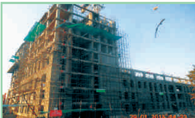
Construction of Emergency Block, Safdarjung Hospital, New Delhi