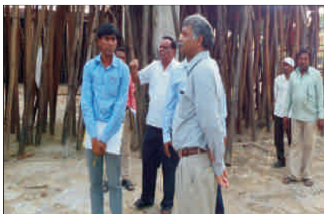
50 Bed Mother & Child Hospital at Kathgorda, Chattisgarh (under NRHM)