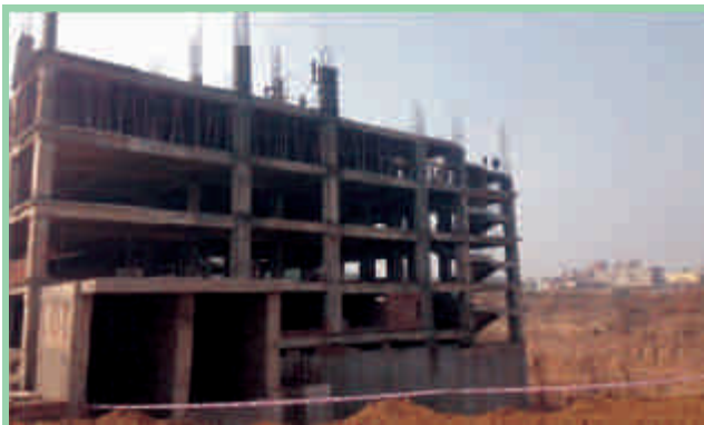
Construction of Surgical Block, AIIMS, New Delhi