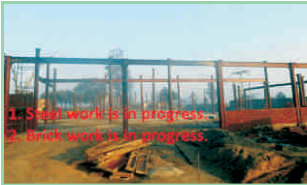
Construction of PGI Satellite Centre at Sangrur