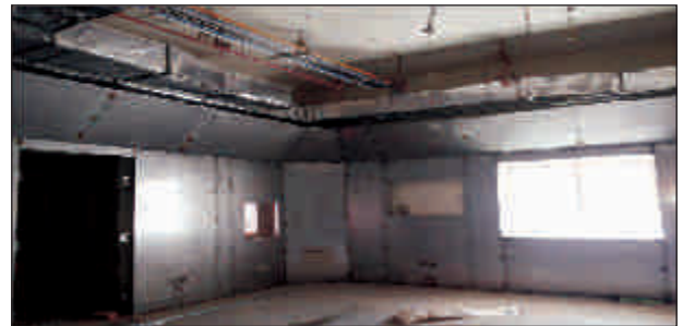
Modular OT, Dr. R. P. GMC, Tanda ( Under Construction)