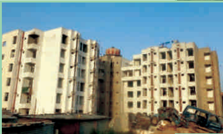
Construction of Hostels at AIIMS, New Delhi