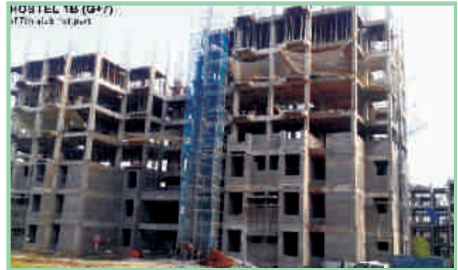
Construction of Hostel Buildings at AIIMS, Raibareli.