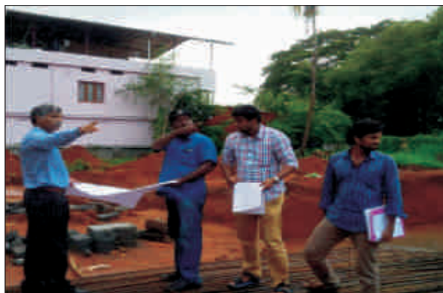
50 Bed Mother & Child Hospital at Irinjalakuda, Kerala (under NRHM)