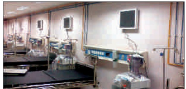
ICU with Gas Manifold System, Trauma Centre, Nepal