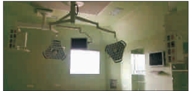
Modular OT, AIIA, Sarita Vihar, New Delhi