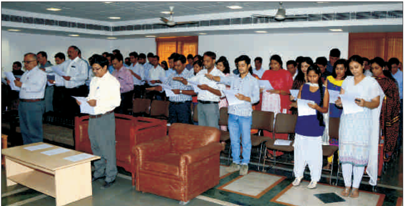
The employees of HSCC taking oath at Head Office on 27th October, 2014 on the occasion of Vigilance Awareness Week . The theme of observing Vigilance Week is “ Combating Corruption – Technology as an Enabler. ” The CVO in his address on the occasion, emphasized that all employees must continuously strive to bring about integrity and transparency in all spheres of life.