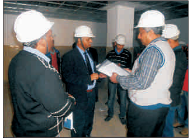
Guru Teg Bahadur Diagnostic Centre, Govt. Medical College, Amritsar on 12th February, 2015