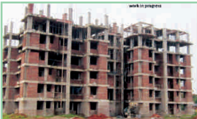
Up-gradation work at Lokopriya Gopinath Bordoloi Regional Institute of Medical Health (LGBRIMH), Tezpur, Assam