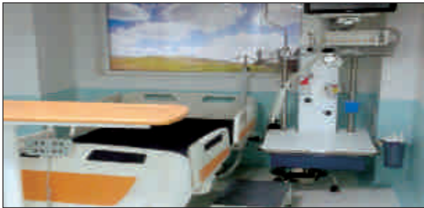
CCU, AIIMS, New Delhi

This year, HSCC is constructing more than 100 Operation Theatres and ICUs/CCUs/ICCU's, Kitchen, Laundry, CSSD & Manifold System of High standard asepsis in different hospitals throughout India and abroad. These include Modular Operation Theatres for Sports Injury Centre, New Delhi; All India Institute of Ayurveda, Sarita Vihar, Trauma Centre, Kathmandu Nepal, etc. HSCC has also constructed highly cleaned CCU with pre-fabricated panels and laminar air flow system in each cubicle at AIIMS, New Delhi.