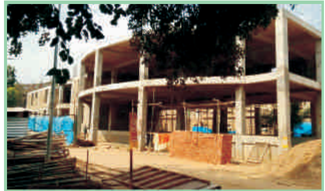
Construction of 42 bed Metro Block (High risk Pregnancy Ward ) in the Campus of Vani Vilas Hospital, Bengaluru