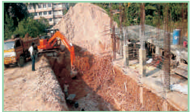
50 Bed Mother and Child Hospital, Chengannur, Kerala