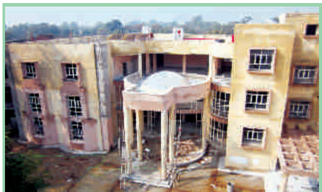
Construction of Nursing College at GMC, Patiala

“Take up one idea. Make that one idea your life – think of it, dream of it, live on that idea. Let the brain, muscles, nerves, every part of your body, be full of that idea, and just leave every other idea alone. This is the way to success.”