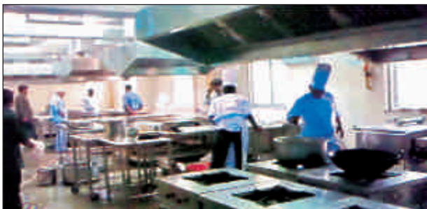
Modular Kitchen, LRSI, New Delhi