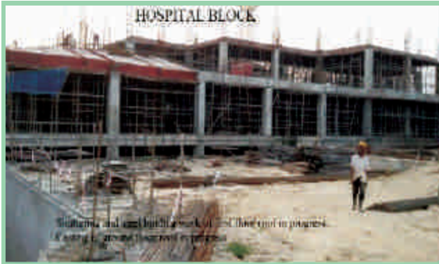
Construction of Kalpana Chawla Govt. Medical College, Karnal