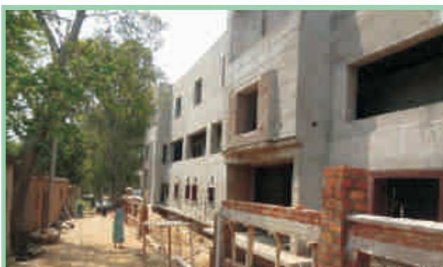
Construction of GPL Standard Invivo Laboratory at Indian Institute of Integrative Medicine (IIM), Jammu