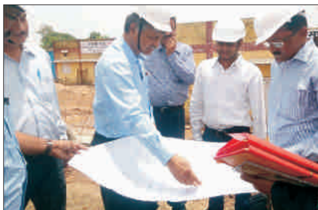
50 Bed Mother & Child Hospital at Pandariya, Chattisgarh (under NRHM)