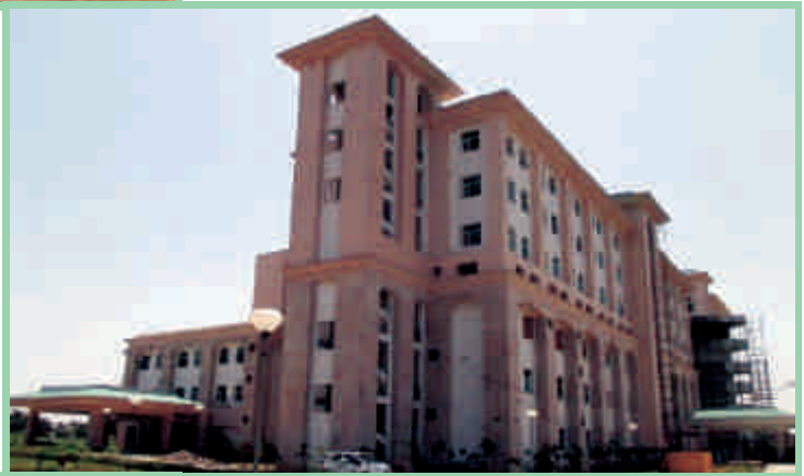
Construction of All India Institute of Ayurveda, New Delhi