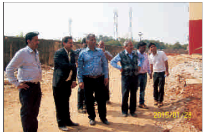
Housing Complex, AIIMS, Bhubaneswar on 28th January, 2015