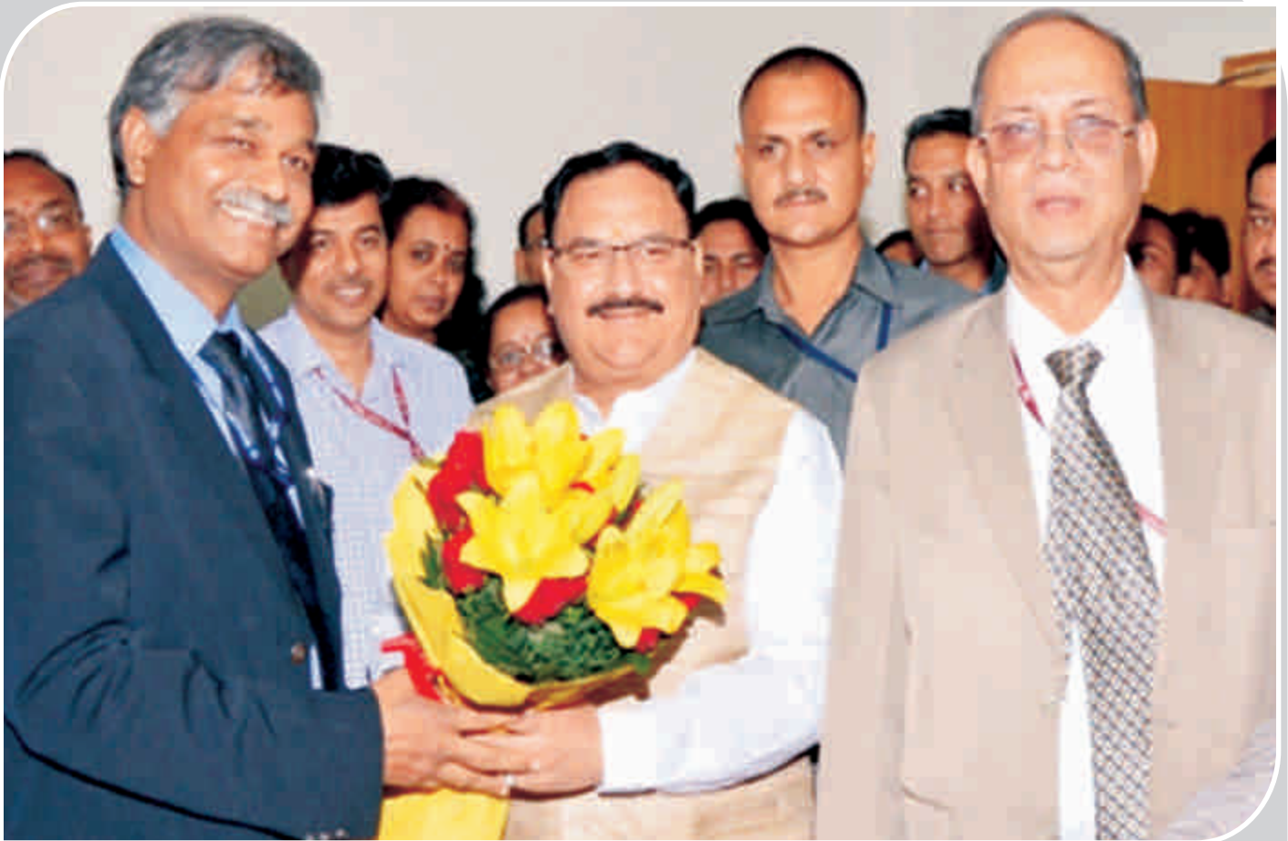
Hon'ble Union Minister of Health & Family Welfare, Shri J. P. Nadda being welcomed by Shri Gyanesh Pandey, CMD, HSCC on assuming charge as Minister of Health & Family Welfare on November 10, 2014.