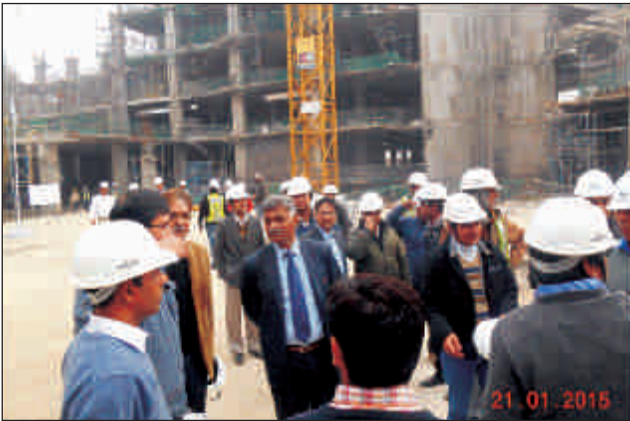
Re-development of Safdarjung Hospital on 21st January, 2015