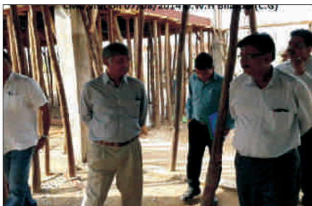
Drug Ware House, Bilaspur, Chattisgarh (under NRHM)