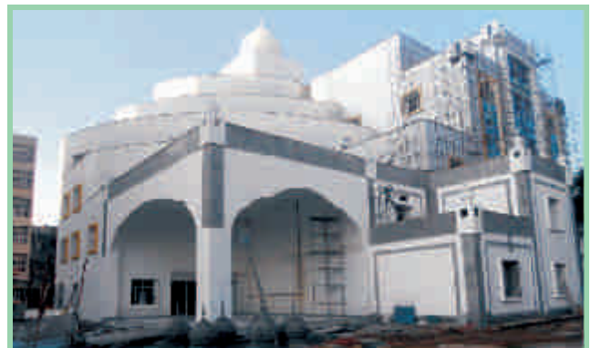
Construction of Guru Teg Bahadur Diagnostic Centre, Govt. Medical College, Amritsar (Under PMSSY)