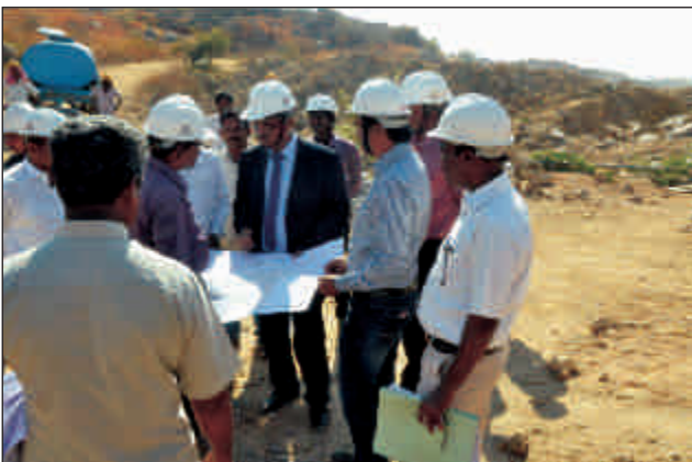
NIAB, Hyderabad on 27th January, 2015