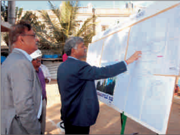
Metro Hospital Block (High Risk Pregnancy Ward) site, Bengaluru on 5th December, 2014