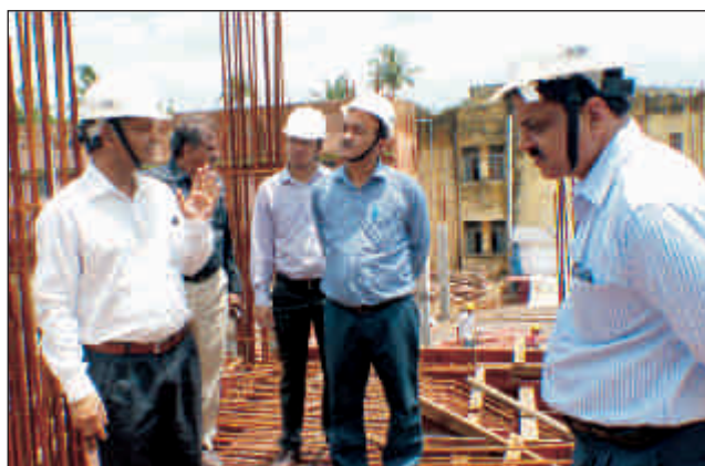
100 Bed Mother & Child, Durg, Chattisgarh (under NRHM)