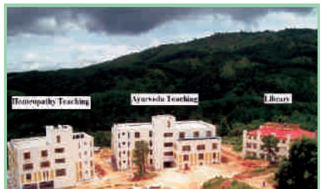
Construction of Hospital Complex for North Eastern Institute of Ayurveda & Homeopathy (NEIAH), Shillong, Meghalaya