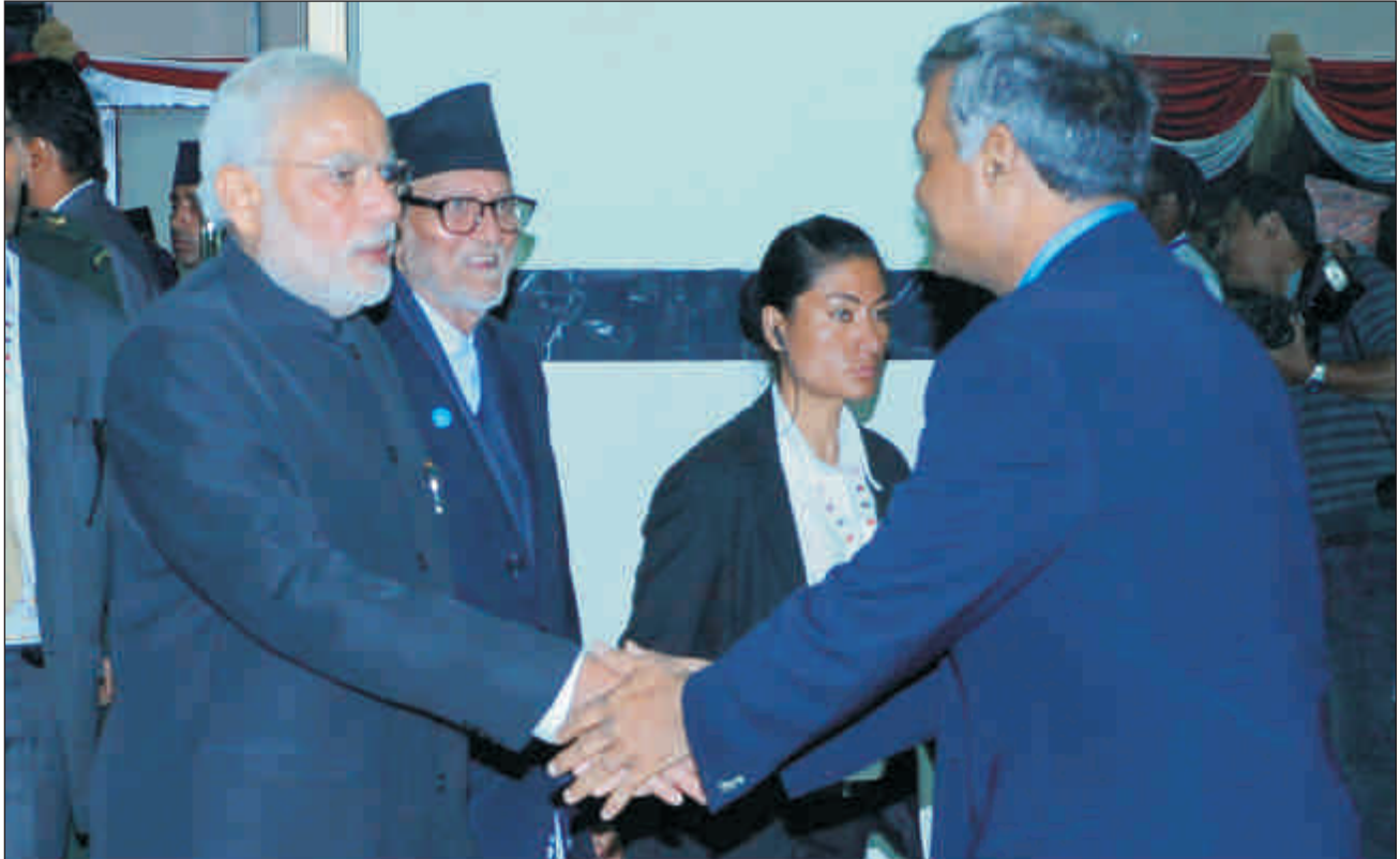
Hon'ble Prime Minister of India, Shri Narendra Modi and Hon'ble Prime Minister of Nepal Shri Sushil Koirala jointly inaugurated the National Trauma Centre, Nepal, Kathmandu