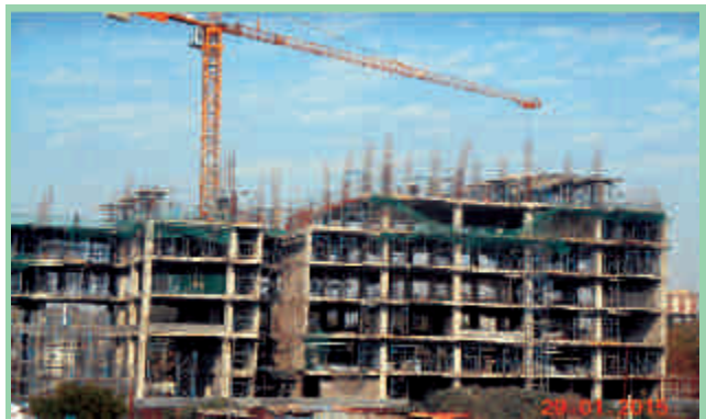
Construction of Super Speciality Block, Safdarjung Hospital, New Delhi