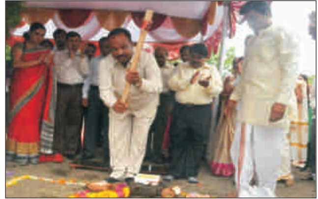
Hon'ble Cabinet Minister of Animal Husbandry, Govt. of Maharashtra, Shri Abdul Sattar performed the Bhumi Pujan and laid foundation stone for the upcoming Poultry & Viral Vaccine Manufacturing Laboratory at IVBP, Aundh, Pune on 27th August, 2014.