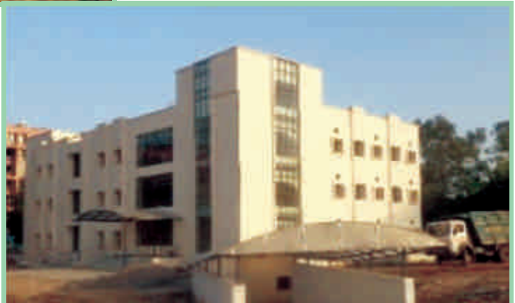
Construction of Dining Block, AIIMS, New Delhi