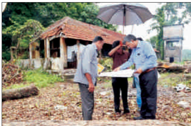
50 Bed Mother & Child Hospital at Chenganoor, Kerala (under NRHM)