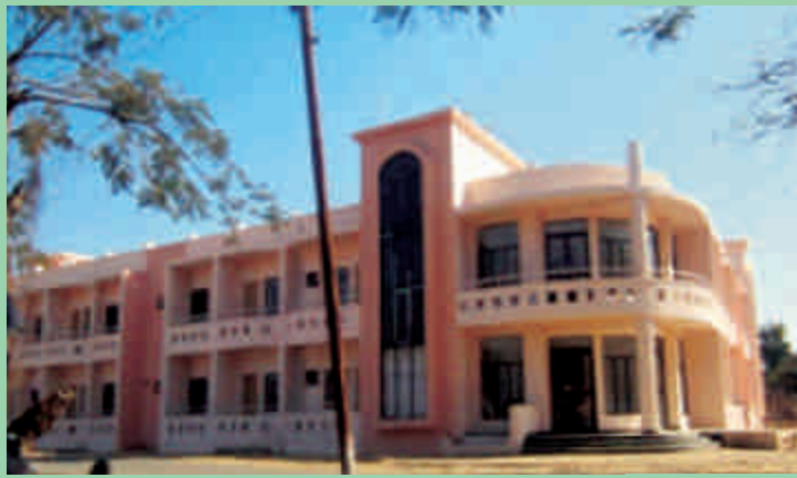
Construction of Hostels for Regional Institute of Medical Sciences (RIMS), Imphal