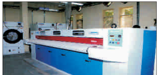
Mechanised Laundry, LRSI, New Delhi