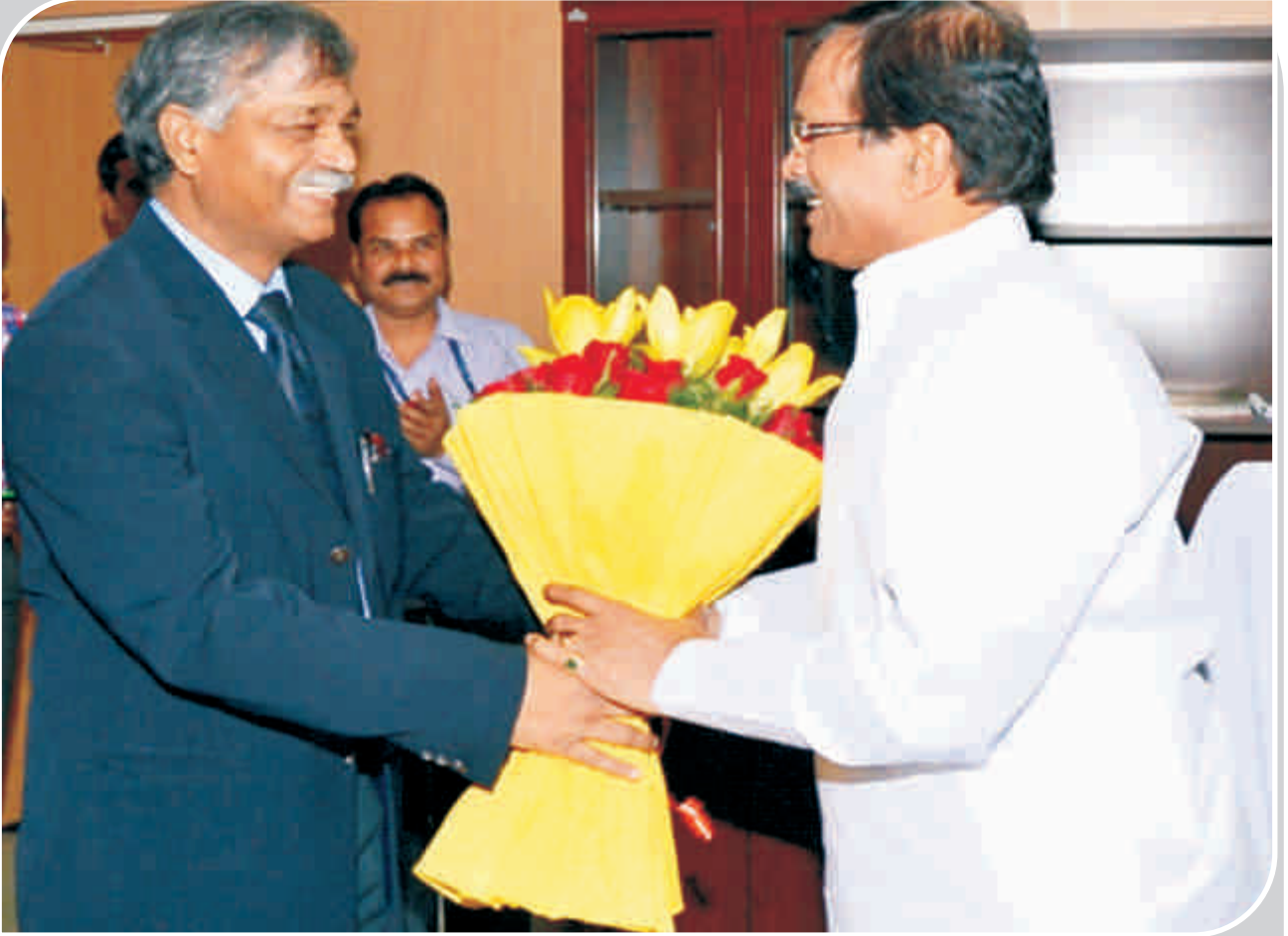
Hon'ble Minister of State , Shri Shripad Yesso Naik being welcomed by Shri Gyanesh Pandey, CMD, HSCC on assuming charge as Minister of State (Independent Charge), Department of Ayurveda, Yoga and Naturopathy, Unani, Siddha and Homeopathy (AYUSH) on November 11, 2014.